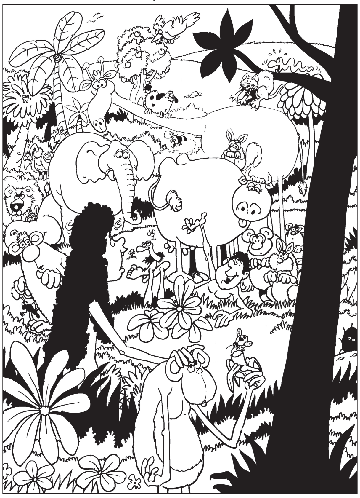
God creates Adam and Eve to care for God's creation.